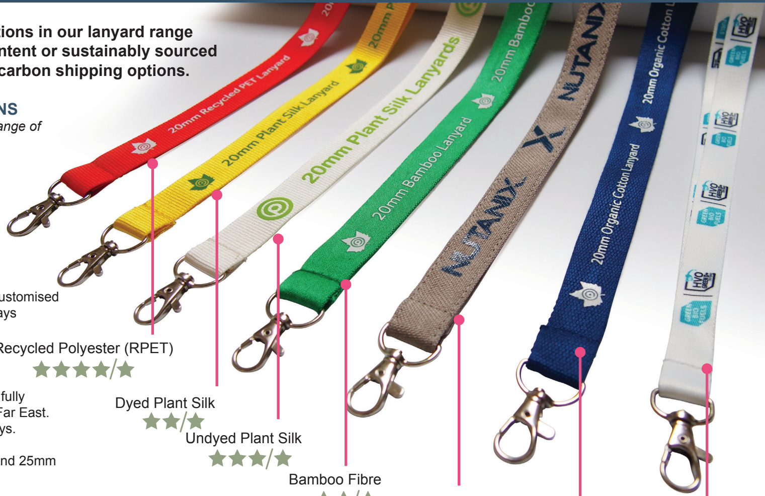
Recycled Polyester (RPET)

All lanyards can be specified with our new Eco Safety Break - made with sustainable Wheat Straw plastic.